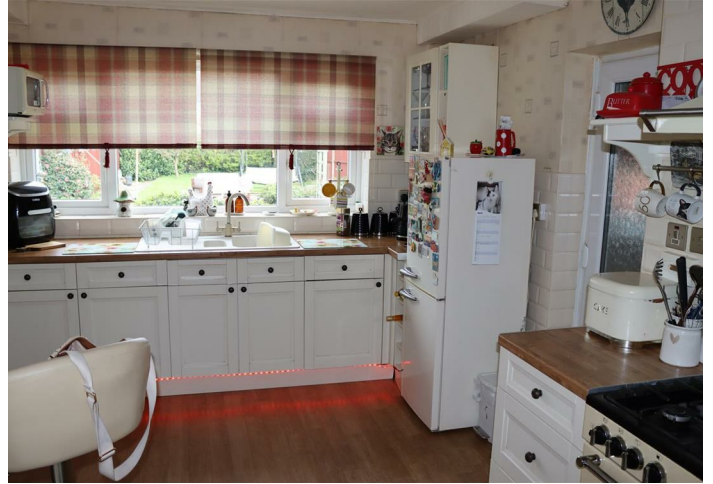
Open Plan Dining/Kitchen