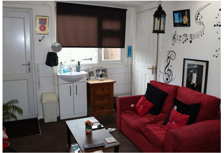
Sitting Room/Bedroom Four