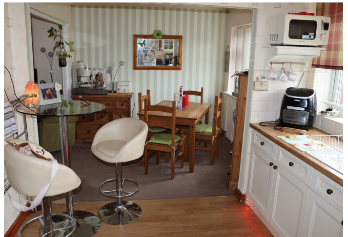
Open Plan Dining/Kitchen